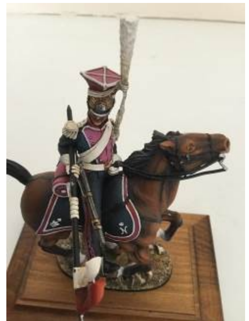
Model of a French Lancer, Waterloo, 18 June 1815.