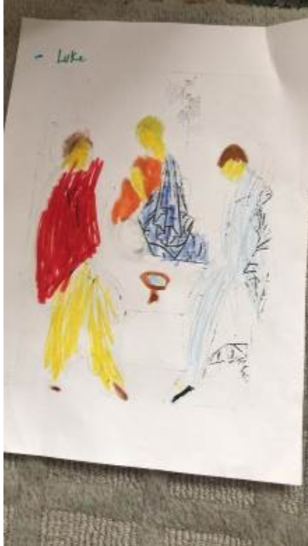
Luke's second drawing of the Trinity for Children's Liturgy.