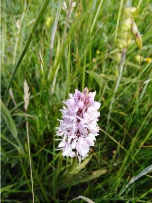
Viv and Allan spotted a wild orchid on Poolbrook Common.