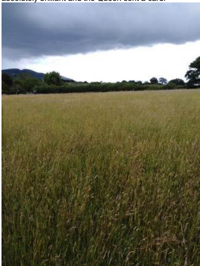
Viv and Allan were caught in a cloud burst on the wildflower meadow at Castlemorton.