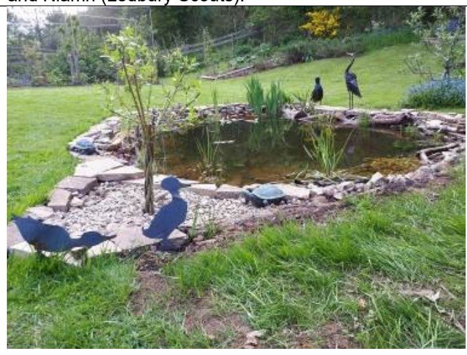
... and look at it now!