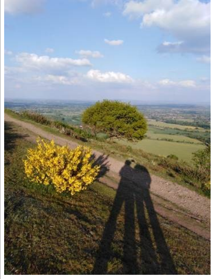
Viv and Alan: Shadows Again