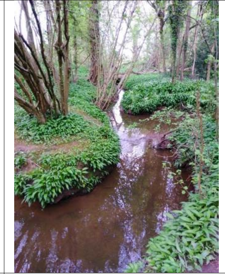
Viv Jones: Beside still waters