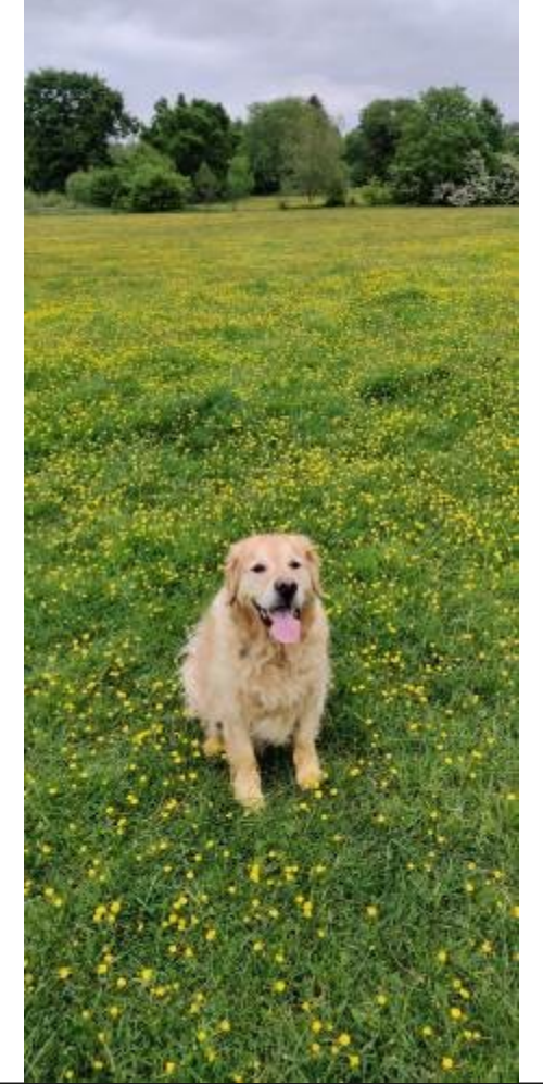
Al Hood's dog, Tiger, looking very pleased with himself after losing his ball in the buttercups.