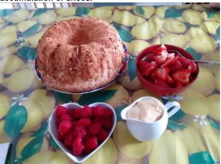
Afternoon Tea at the Craigs with Angel Food Cake, custard, raspberries and strawberries. We used 12 egg whites to make the Angel Food.