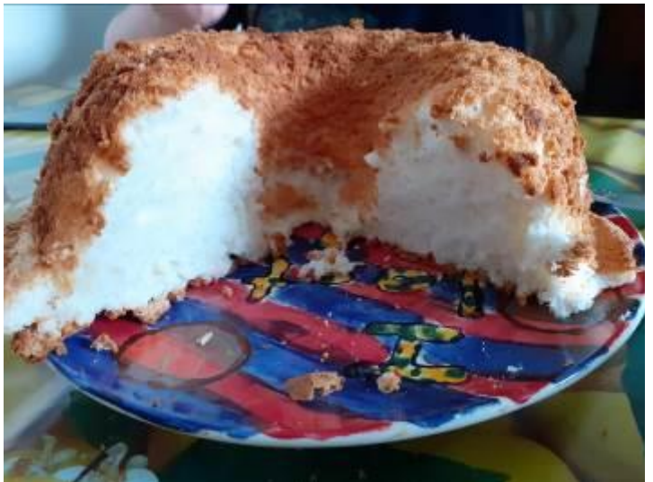
The cake is a cross between a meringue, a marshmallow, a a cake and a cloud; fat-free, but full of sugar!