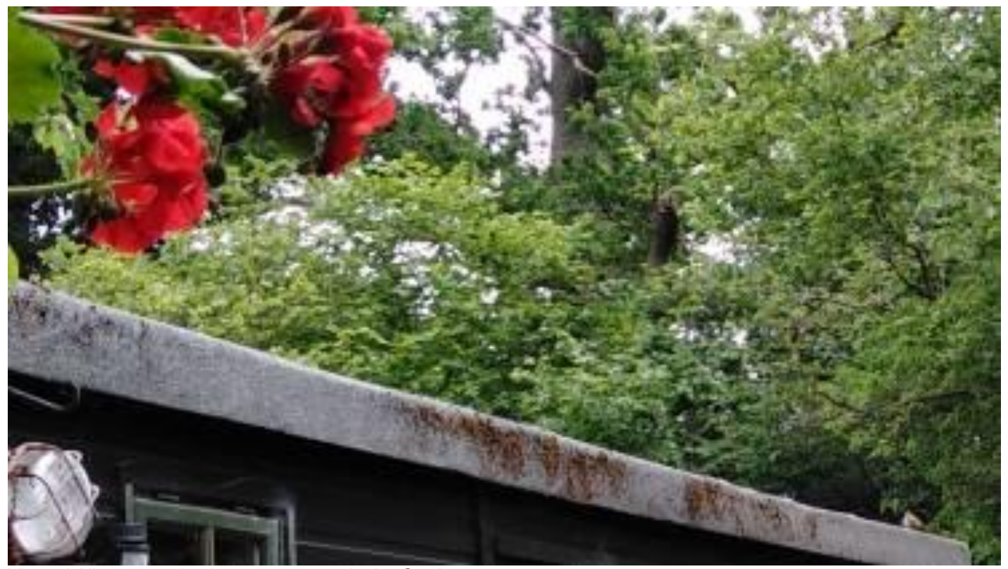
Viv and Allan spotted a tiny tree sparrow in the Garden.