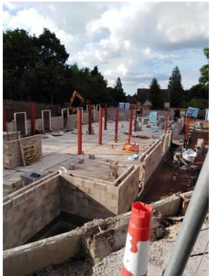
New nursing home under construction on the site of the old cottage hospital in Lansdowne Crescent.

Viv and Allan spotted a tiny tree sparrow in the Garden.