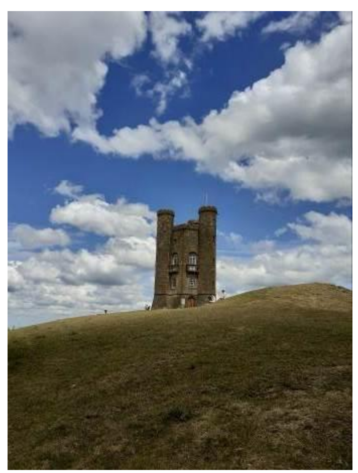
The Craigs walked from Broadway to Broadway Tower, where they picnicked, and then walked back to Broadway.