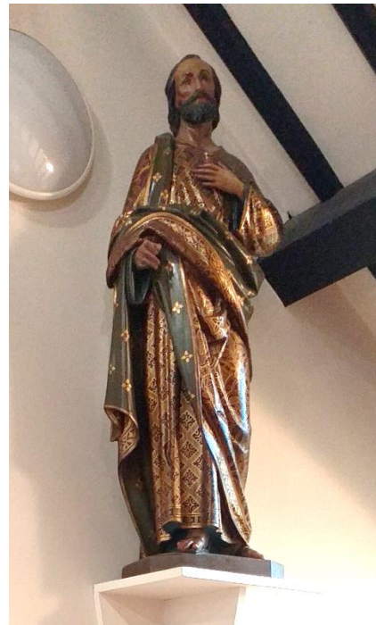
Our Lady, Queen of Heaven & St Joseph, husband of Mary