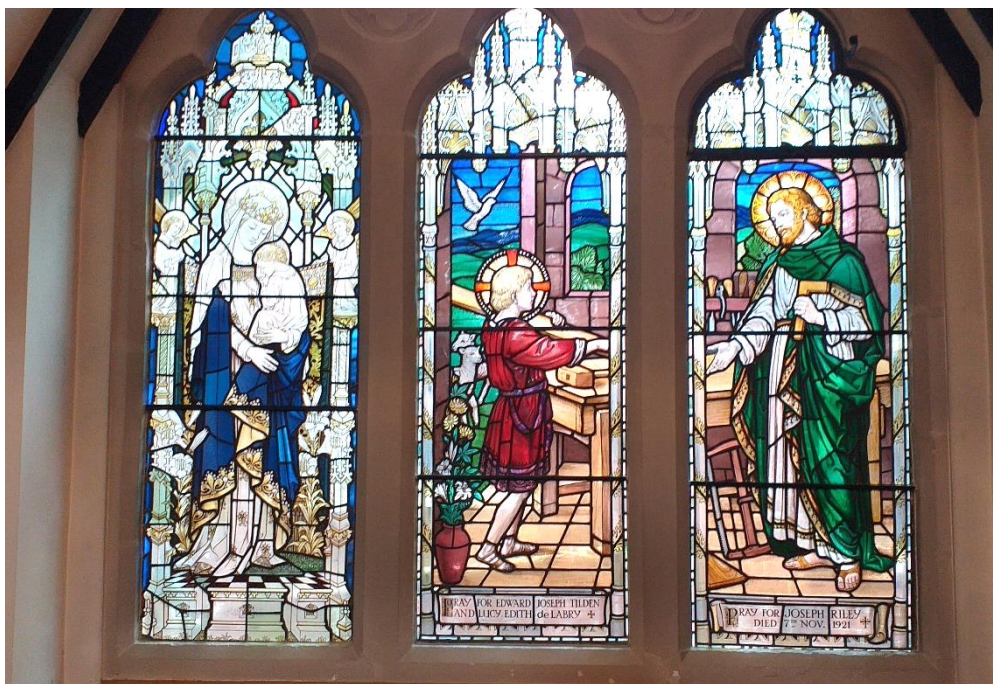
Mary with the infant Jesus & Jesus as an apprentice carpenter under the watchful and caring eye of St Joseph