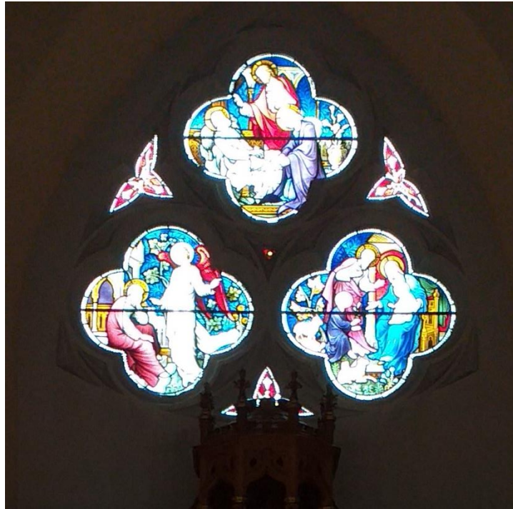
St Joseph triptych above the reredos:

Joseph is visited by an angel to tell him of Mary's pregnancy