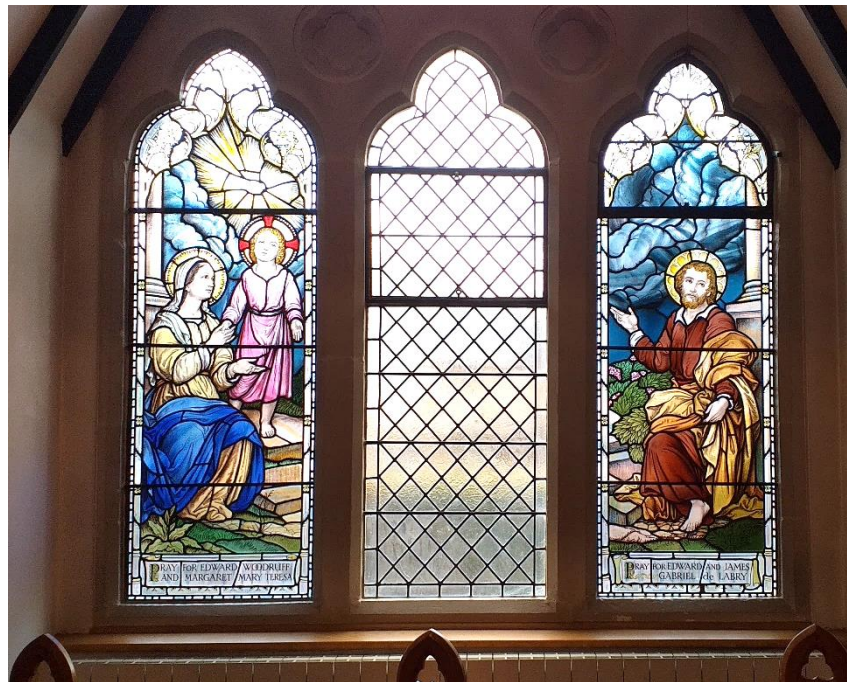
The Holy Family of Jesus, Mary & Joseph