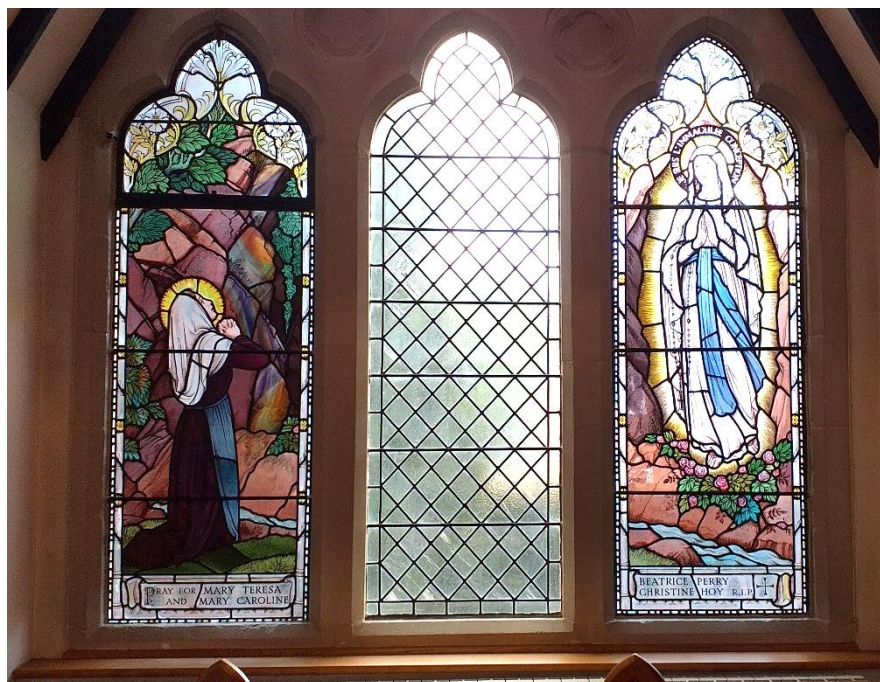
St Bernadette kneeling in prayer before Our Lady of Lourdes