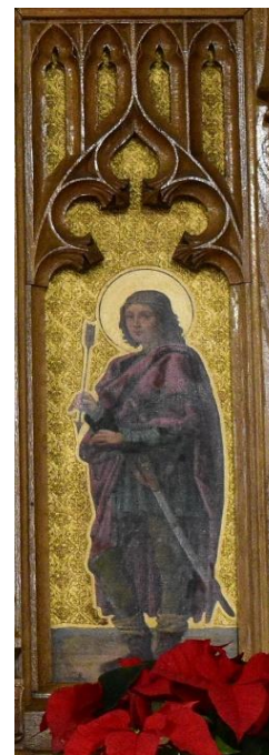
St. Edmund king of East Anglia, who was patron saint of England before St. George.

Georgia, Lithuania, Palestine, Portugal, Germany, Greece, Russia, Istanbul, Ethiopia, Serbia, Croatia, Bosnia, Montenegro, as well as a lot of cities, e.g. Barcelona, Aragon, Catalonia, Genoa, and Venice (after St. Mark). He is also patron saint of Scouts. I suspect that there are a lot more - if you know, please let me know!