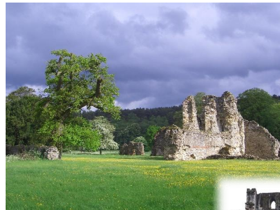
Top: Waverley Abbey , Middle: Rievaulx , Bottom: Fountains .

Bernard loved to pray more than anything else, and this constant call to be with Jesus showed in the way he treated other people and the way he ran his community. At first, he was so passionate about living a strict and pure life, it was too much for his community who began to grumble and lose faith. Bernard saw that not everyone was called to that level of discipline, and he relaxed some of the rules. When he wasn't praying, Bernard was teaching and supporting his community and a lot of his sermons have survived. Bernard did not enjoy good health and was often so ill that everyone thought that he was going to die. However, he lived to the age of 63, a good age then. He was canonised in 1174, only 21 years after his death, and was declared a doctor of the Church in 1830.