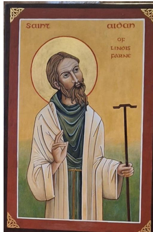
A modern icon of St. Aidan at his shrine in St. Aidan's church, Bamburgh.

We have seen how the king acted as Aidan's translator in his travels around the north of England. But King Oswald found Aidan to be a wise friend and adviser. After Oswald's death, Aidan continued his ministry under his successor, King Oswin, and eventually died at in his wooden church beside the castle at Bamburg. The church there is dedicated to him and there is a modern shrine to him there.