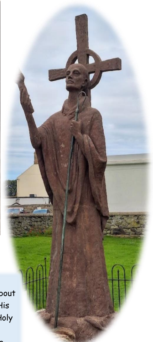
A modern statue of St. Aidan at Lindisfarne.