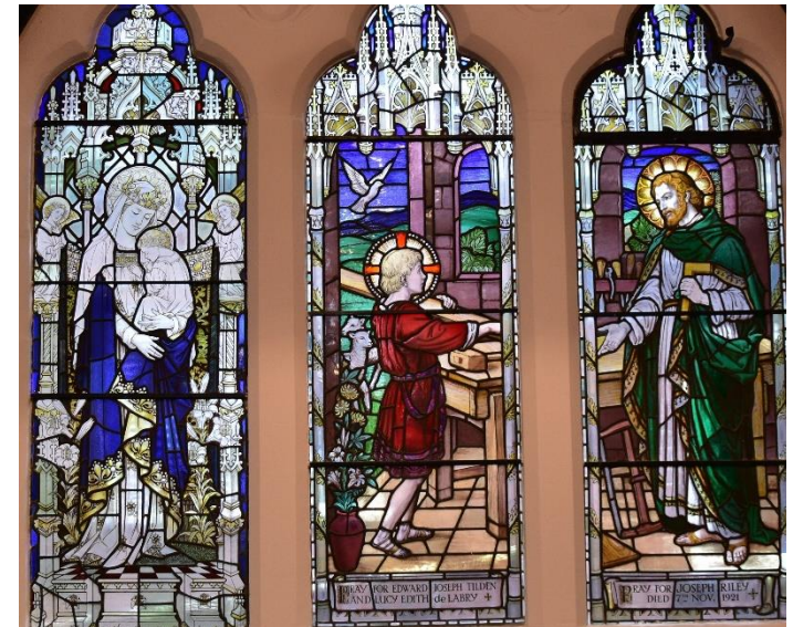
Holy Family window in St. Joseph's Malvern

18 th March: St. Joseph, patron of a happy death, pray for us