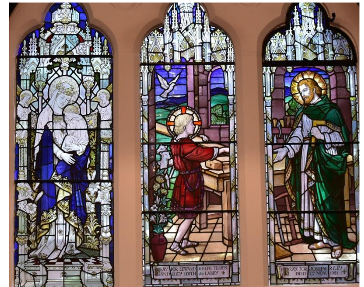
Holy Family window in St. Joseph's Malvern

18 th March: St. Joseph, patron of a happy death, pray for us