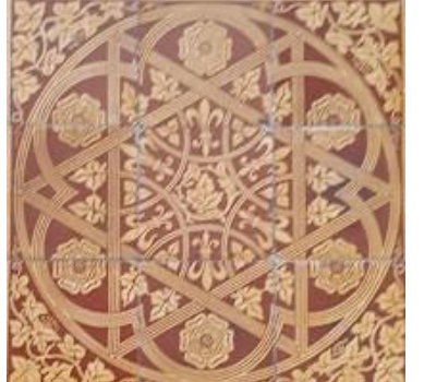
S&C Version 2023 09 – 1